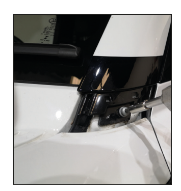
Undo the T30 torx screw.