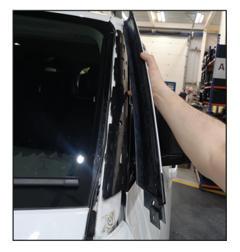
Trim can now be removed