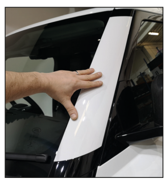
Slide the A pilar trim downwards.