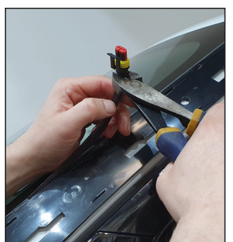
run the wiring harness cable up the 'A' pillar, and cut the plug.