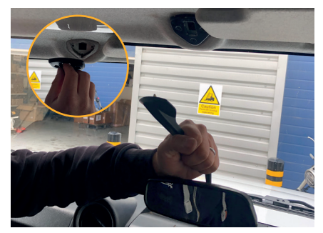
5. Remove ultra sonic module.