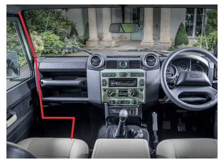
9. Drill the 9.5mm cable entry hole in the side of the roof, 75mm from the front of the gutter, 30mm in height.

7. Run the lamp wire as shown up to the left hand 'A pillar' as shown below.