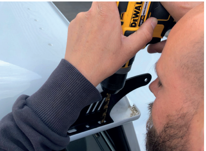
4. Use the included spacers and anti-theft hardware to mount the lamp to the brackets and apply nut caps.

2. Drill out 2x 6mm holes to use for mounting the brackets.