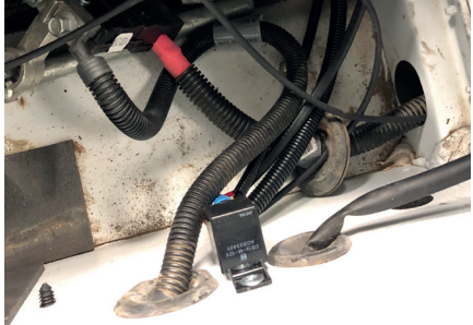
6. Remove the lamp connector from the wiring harness and route cables through the supplied cable grommet through to the left footwell.

5. Re-connect the battery and connect live and earth wires from relay to the battery.