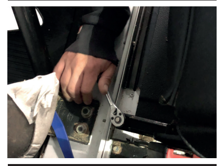
3. Drill a 9.5mm hole from the bottom of the battery compartment into the left hand footwell to run the lamp and switch wires.

1. Undo The 4x bolts holding in the left hand seat. Remove seat to access battery.